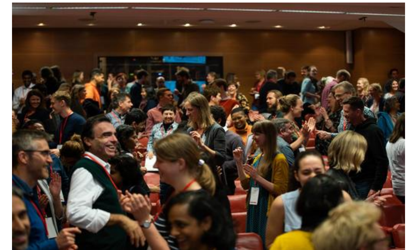
MSF Scientific Days 2019

In February 2020, 21 people that presented their research studies or innovation projects at Scientific Days 2020 were asked to complete a short online survey. Each presenter was asked to report: whether their project had been further disseminated, and in what format; whether the study/project impacted programmes or policies; and whether presentation at the event was of value. Follow up emails were sent to those that did not respond initially. Data from the research and innovation days were analysed separately in Microsoft Excel.