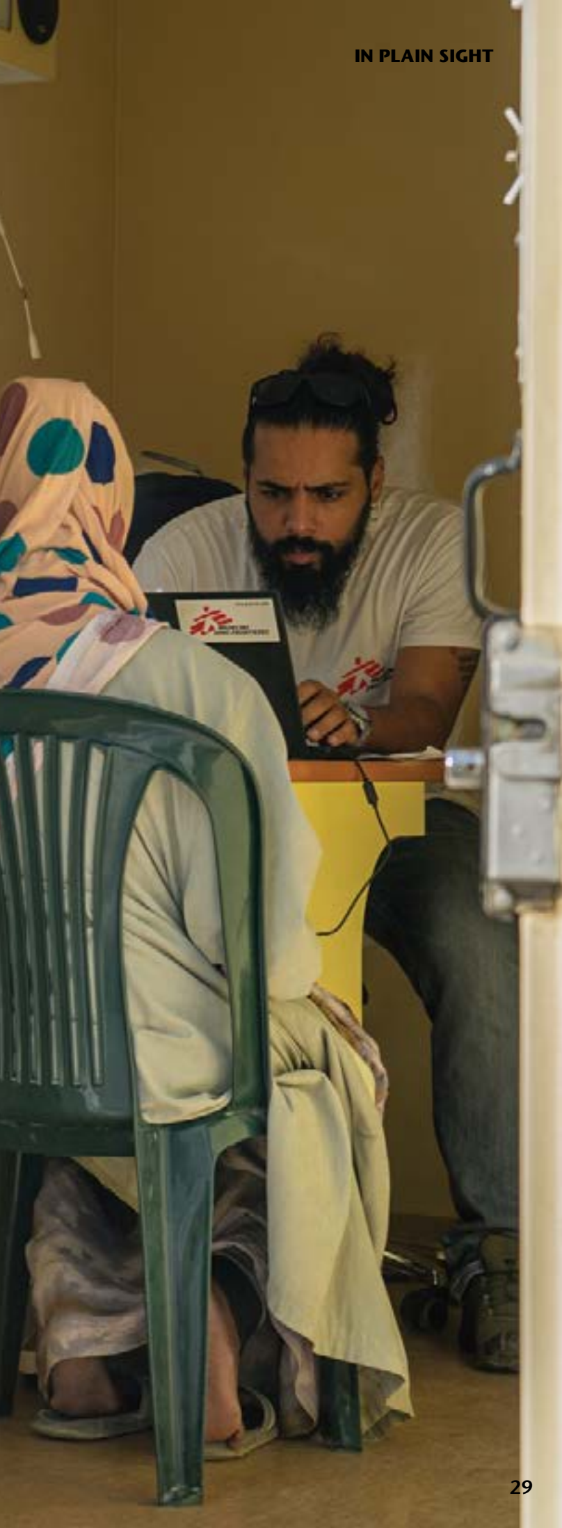
AEDECINS TIATPOI XS

"We couldn't go back to our country and we were not welcome in Turkey either. We had signed those papers that said that we had to leave Turkey within 30 days. We had to leave before the police would catch us... We were living a life in fear. All we could do was to keep going. My belly was growing, our living conditions were not good at all."<sup>96</sup>