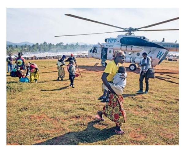
▲ Patients are taken by helicopter to the hospital in Bunia.