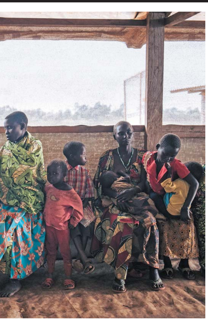
◆Families wait in the triage room of the MSF field hospital.