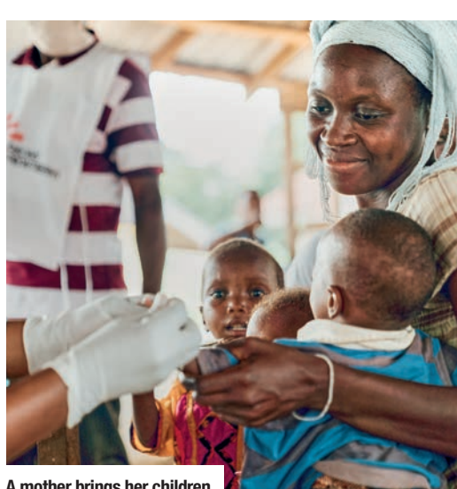
to he tested for malaria