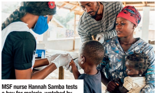
a boy for malaria, watched by his family, in Bumbeh village.

"You finish the day and you know you've done important work."