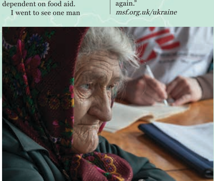
When the shells started falling, most people fled the cities of east nany of the elderly, sick and disabled had no choice but to stay.