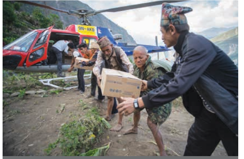
MSF staff and local Nepalis unload boxes of high-energy biscuits, shelter kits and blankets in Sindhupalchowk district.

On 2 June, a helicopter delivering humanitarian aid crashed in Sindhupalchowk district, Nepal, killing three of our colleagues in the crash. MSF extends its deepest condolences to the families and friends of our staff, and to those of the pilot of the helicopter, who was also killed.