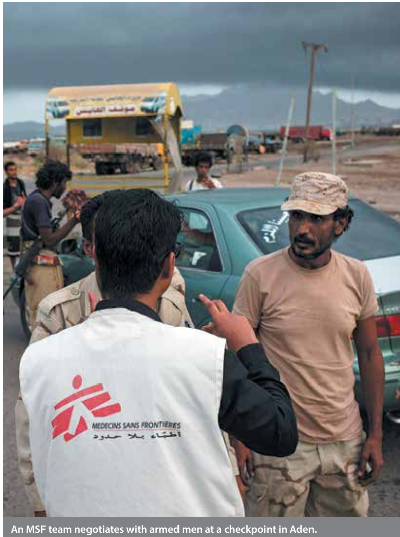
h MSF team negotiates with armed men at a checkpoint in Ad

This is the first place I've been to where I haven't met a journalist at all. This is a conflict that's just not in the public eye. But the public should really be aware of the crisis that is happening in this country, and the difficulties of trying to help the people living here. I feel like the whole world needs to understand what's going on.'