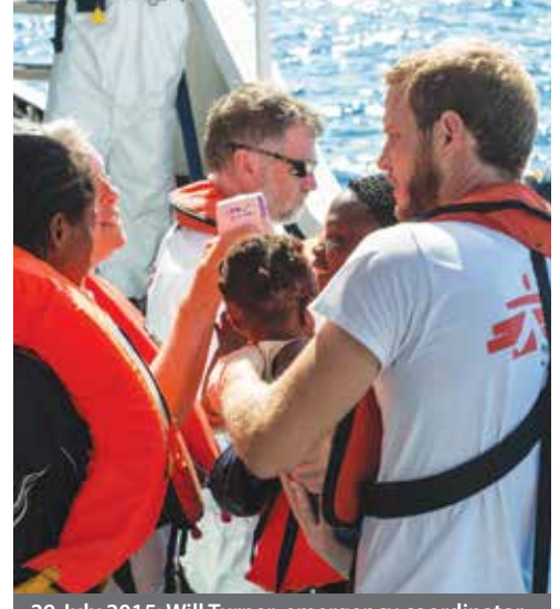
on the MY Phoenix, helps a wo nan and her bab emove their lifejackets after being rescued.