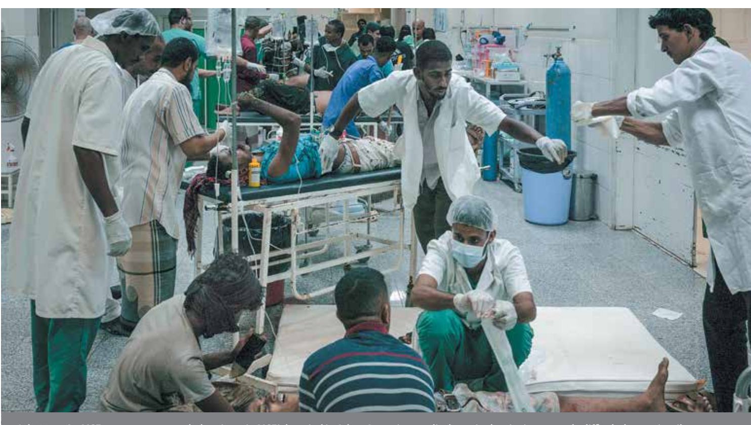
1 July 2015: An MSF team treats wounded patients in MSF's hospital in Aden. Accessing medical care in the city is extremely difficult due to airstrikes, shelling, roadblocks and snipers. MSF has opened an advanced emergency post in Crater, in the south of the city, and runs mobile surgical clinics in two other neighbourhoods.

"This is the first place I've been to where I haven't met a journalist at all."