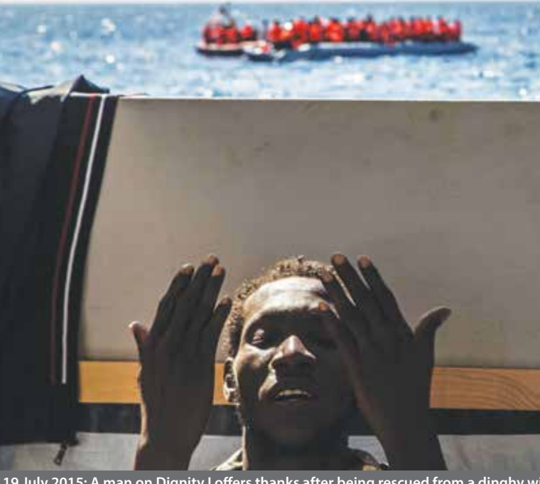
19 July 2015: A man on Dignity I offers thanks after being rescued from a dinghy with 110 people on board.