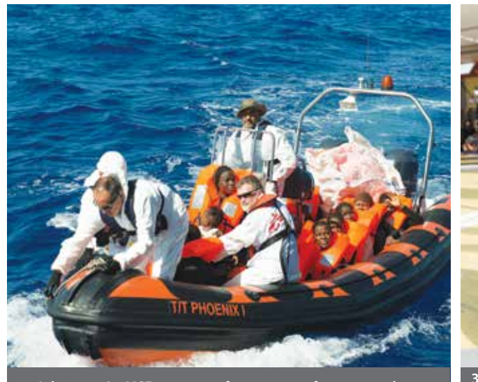
29 July 2015: An MSF team transfers a group of women and children from a dinghy to the MY Phoenix.