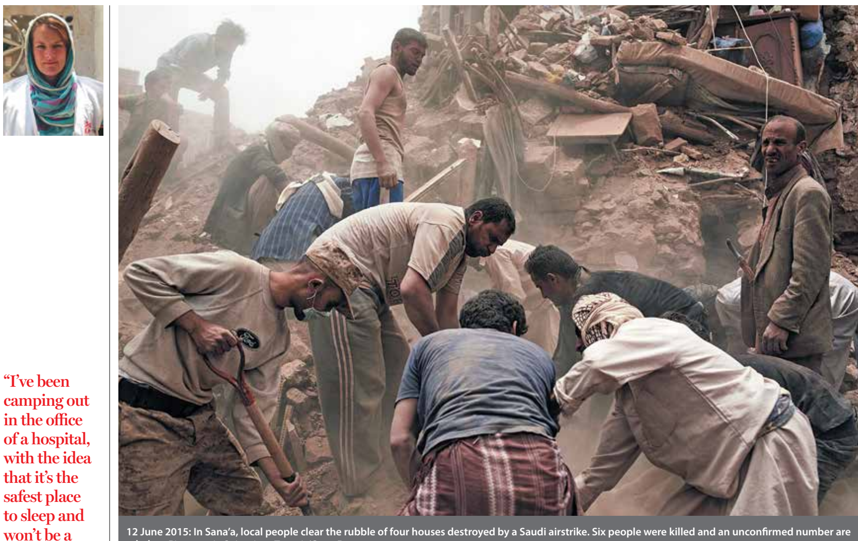
12 June 2015: In Sana'a, local people clear the rubble of four houses destroyed by a Saudi airstrike. Six people were killed and an unconfirmed number are missing.

It's morning now and it's really quiet, just a few birds singing and a small child walking a flock of sheep beneath my window. I really didn't get the sleep that I was hoping for last night. We were all hoping the ceasefire would start, but by three in the morning, I started to receive text messages saying that warplanes were dropping bombs. I haven't had any more information yet on whether people were killed or injured.