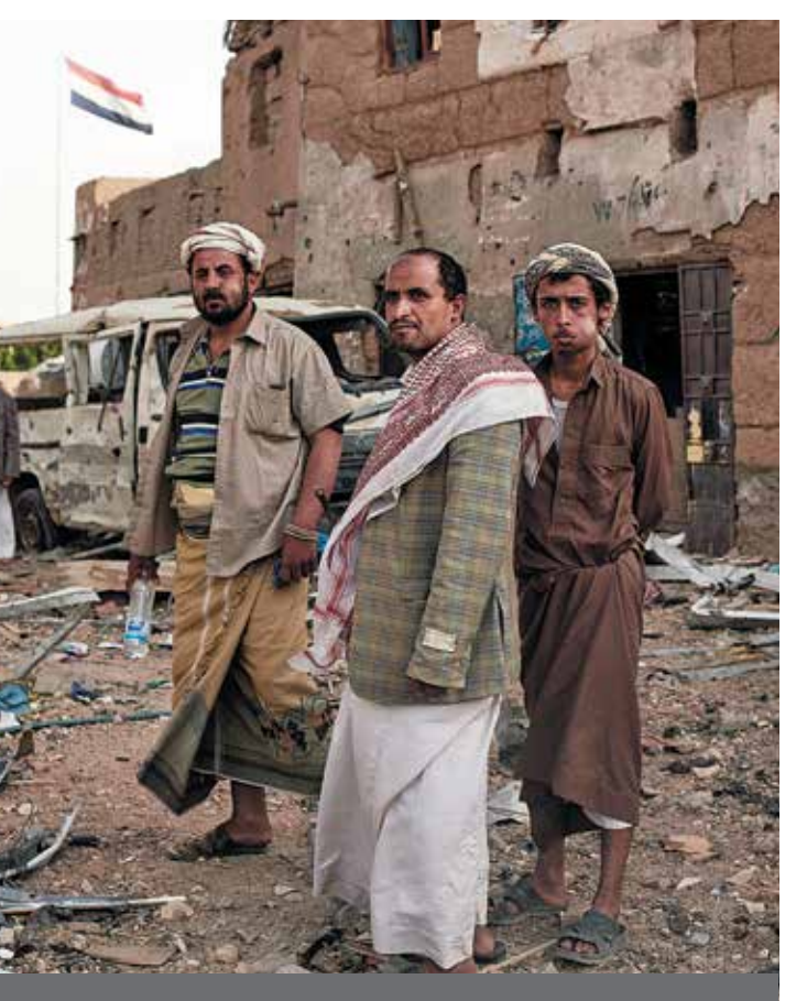
15 June 2015: Local people walk through the destroyed city of Sa'ada, which has been hit by daily airstrikes since Saudi-led coalition forces declared the entire area a "military target".