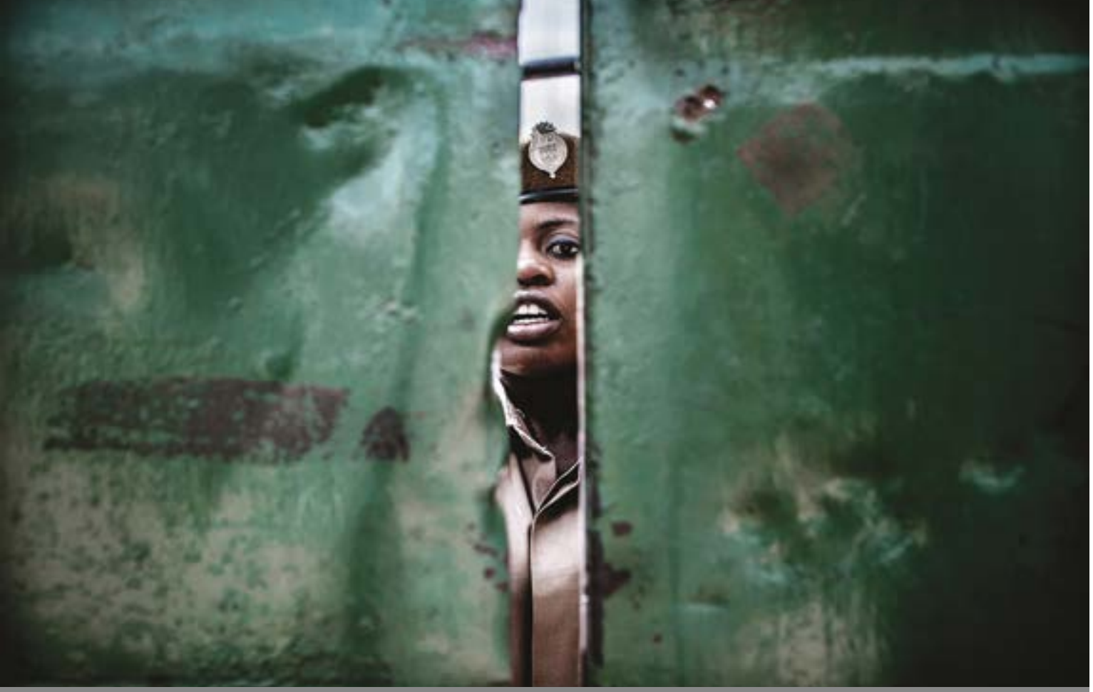
Chichiri prison, 27 May 2015. A prison guard closes the main gate as she shouts to prisoners' relatives that visiting time is over. MSF staff provide medical care to the guards as well as the prisoners.

Find out more at msf.org.uk/malawi-prison