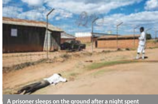
A prisoner sleeps on the ground after a night spent awake in an overcrowded cell. Built to accommodate 800 prisoners, Maula prison now houses 2,650 inmate