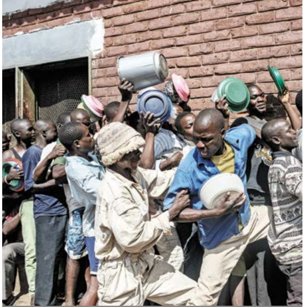
Food distribution in Chichiri prison. Prisoners are fed just once a day, due to the small budget that the Malawian government allocates to the penal system. The quality of the food is poor, with boiled maize flour served six days a week, and boiled beans once a week. As a result, many prisoners suffer from malnutrition.