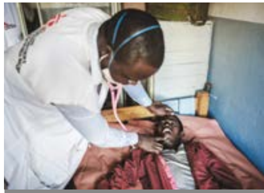
A member of MSF's medical team examines a patient. Detainees in Maula prison often suffer from poor health due to overcrowding and a poor diet.