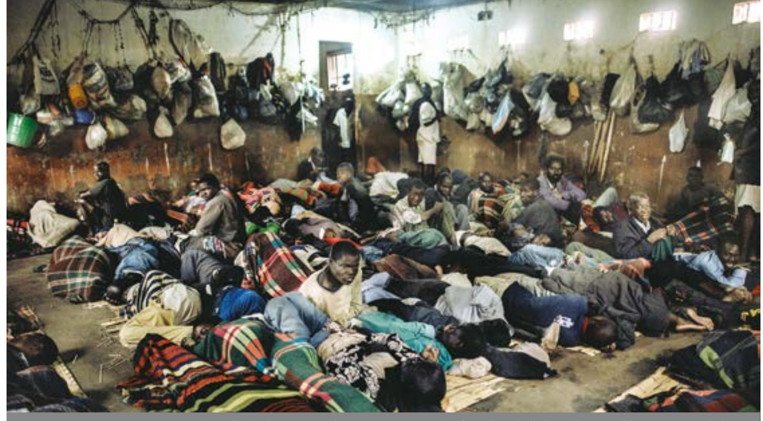
6 am, 25 May 2015. Prisoners in an overcrowded cell in Chichiri prison wait for permission to go outside after 14 hours locked up. Cell 5 is one of the most overcrowded in the prison, and its inmates have the highest incidence of tuberculosis, hepatitis, malaria and HIV in the prison.