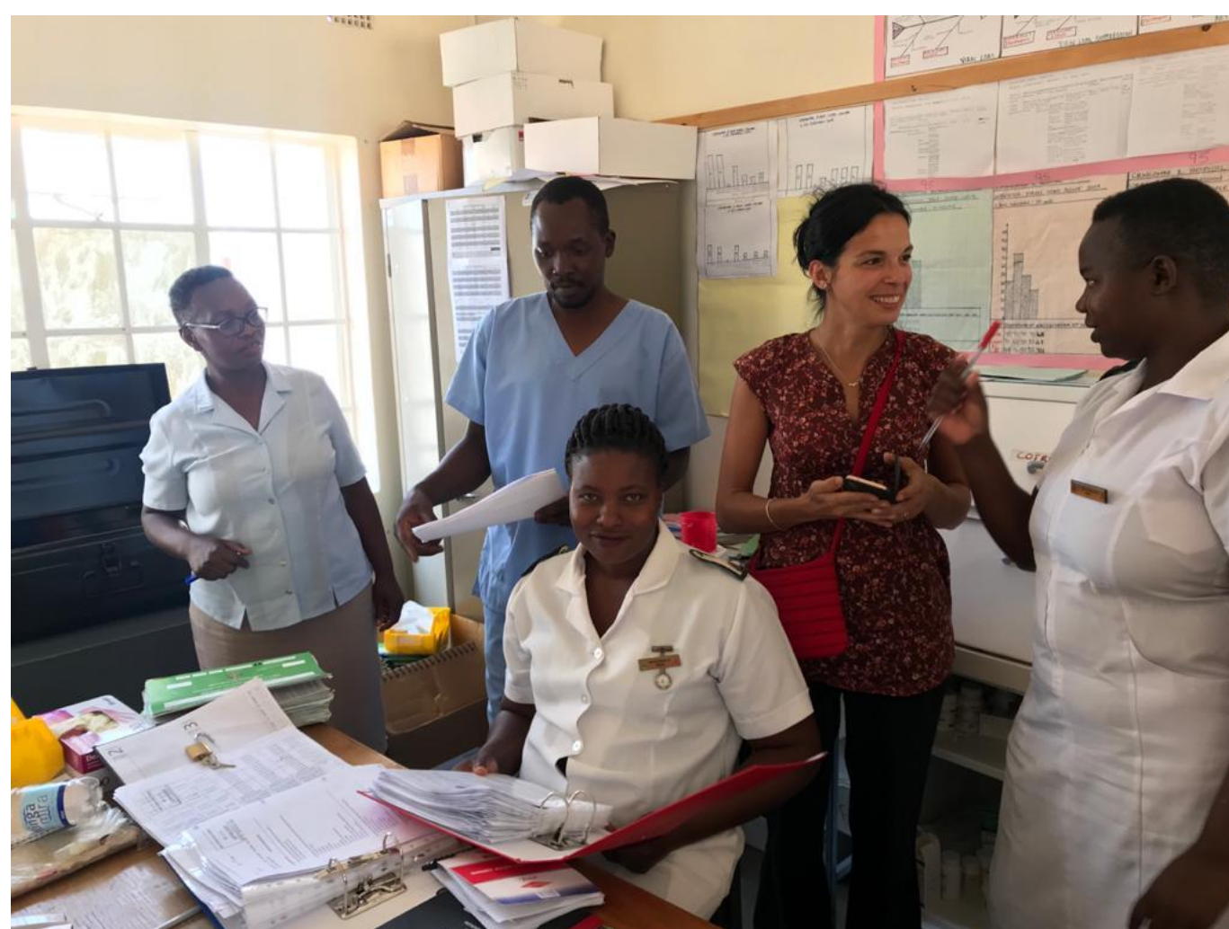
Figure 1: HPV vaccination supervision in a study health facility by study facilitators